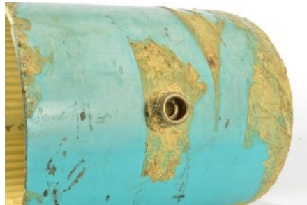
Figure 4. Poorly fitted connection is sealed by expanding grout.