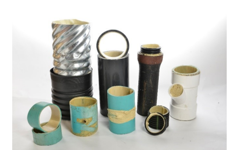
Figure 1. Rigid Seal can line all types of pipes and virtually any diameter.

Rigid Seal has been certified to NSF/ANSI 61 standards by NSF for use in potable water systems (C0314125-01).