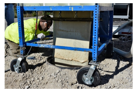
Figure 3. Grout added to funnel and fed into liner grooves which prevents grout from "scraping off" during insertion.

Easy to Reconnect: Because the fully cured liner is translucent, locating and reestablishing service connections is simplified.